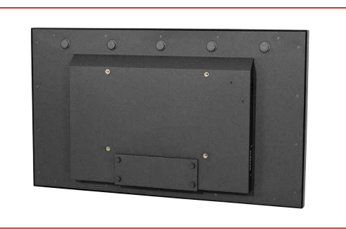
Sealed cable entry helps prevent water and debris from getting inside